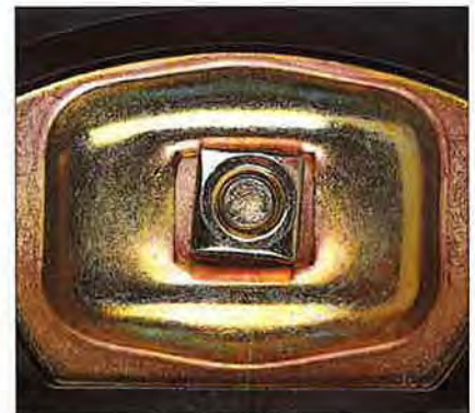
Thanks to the special construction of the pressure plates, the nuts can not be distorted.