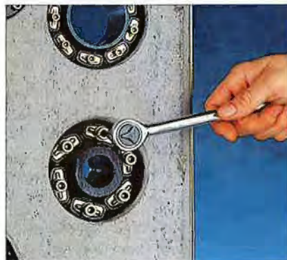
Hexagonal socket head bolts facilitate the assembly of small seal-rings.

This is reducing the necessary stock of different sizes to a minimum.